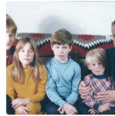
Family Sitting on Couch