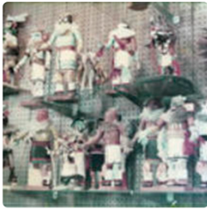
Kachina Dolls on Shelves